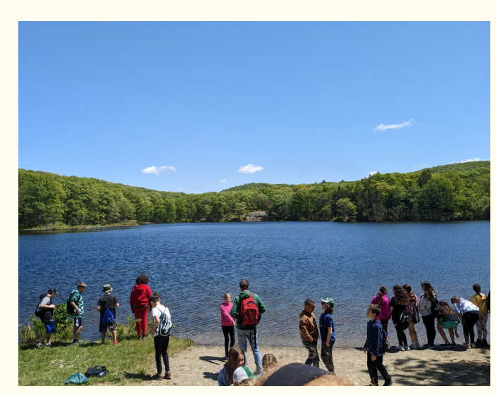
Students visit Black Rock Forest.

In fiscal year 2022, the difference between expenses and income was covered by a combination of regular draws from the endowment and loans from board-designated funds. (www.blackrockforest.org/about/financials)